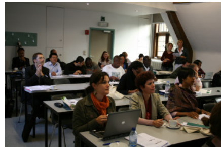
IICCR in Antwerp